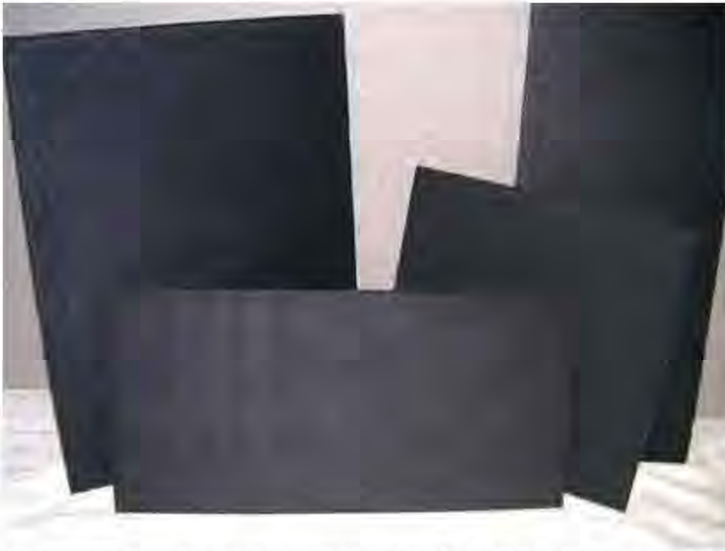
Infrared heating elements are available in standard, off-the-shelf designs such as flat panel models

"I believe it is important that a supplier is willing and able to provide support from design to completion, that you get a personal response, and get to talk with someone who has experience with the application in question," says Stricker. "I feel that the most effective way to provide support is through face-to-face meetings with the OEM's design group. That may be a little bit more time consuming, and may involve flying or driving some distance, but we feel it is important. Of course, in some instances Skype might be as effective as meeting the people in person."