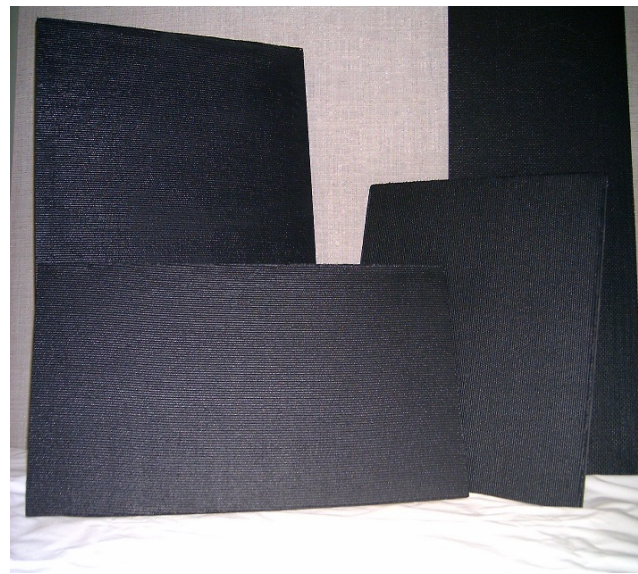
(RADIANT HEATING SURFACE OF FLAT-PANEL ELEMENTS)

6" x 18" 1000W / 120V / 9A 6" x 24" 1500W / 120V / 13A 6" x 36" 2000W / 240V / 15A 12" x 12" 1200W / 120V / 10A 12" x 12" 1500W / 240V / 7A 12" x 18" 1500W / 120V / 13A 12" x 18" 1600W / 240V / 7A 12" x 18" 2000W / 240V / 9A 12" x 24" 2000W / 240V / 9A 12" x 24" 2400W / 240V / 10A 12" x 24" 3000W / 240V / 13A 12" x 30" 3000W / 240V / 13A 12" x 36" 3600W / 240V / 15A 12" x 36" 4500W / 240V / 19A 16" x 16" 700W / 120V / 6A 16" x 16" 1600W / 120V / 14A 16" x 16" 1800W / 240V / 15A 16" x 16" 1600W / 240V / 7A 16" x 16" 1800W / 240V / 8A 18" x 18" 1950W / 120V / 17A 18" x 18" 2300W / 120V / 20A 18" x 18" 3000W / 240V / 15A 18" x 18" 4000W / 208V / 20A 18" x 18" 4000W / 240V / 17A 18" x 20" 2314W / 120V / 20A 18" x 20" 3000W / 240V / 13A 18" x 22" 4000W / 208V / 20A 18" x 22" 4000W / 240V / 17A 18" x 24" 3000W / 240V / 13A 18" x 24" 4500W / 240V / 19A 20" x 20" 1100W / 120V / 10A 20" x 20" 3000W / 240V / 13A 22" x 24" 5000W / 240V / 21A 24" x 24" 4500W / 240V / 19A 24" x 30" 4500W / 240V / 19A